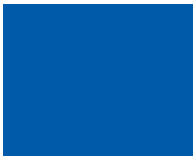
NOVACRON Blue MI-600