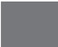
NOVACRON Gray MI-800